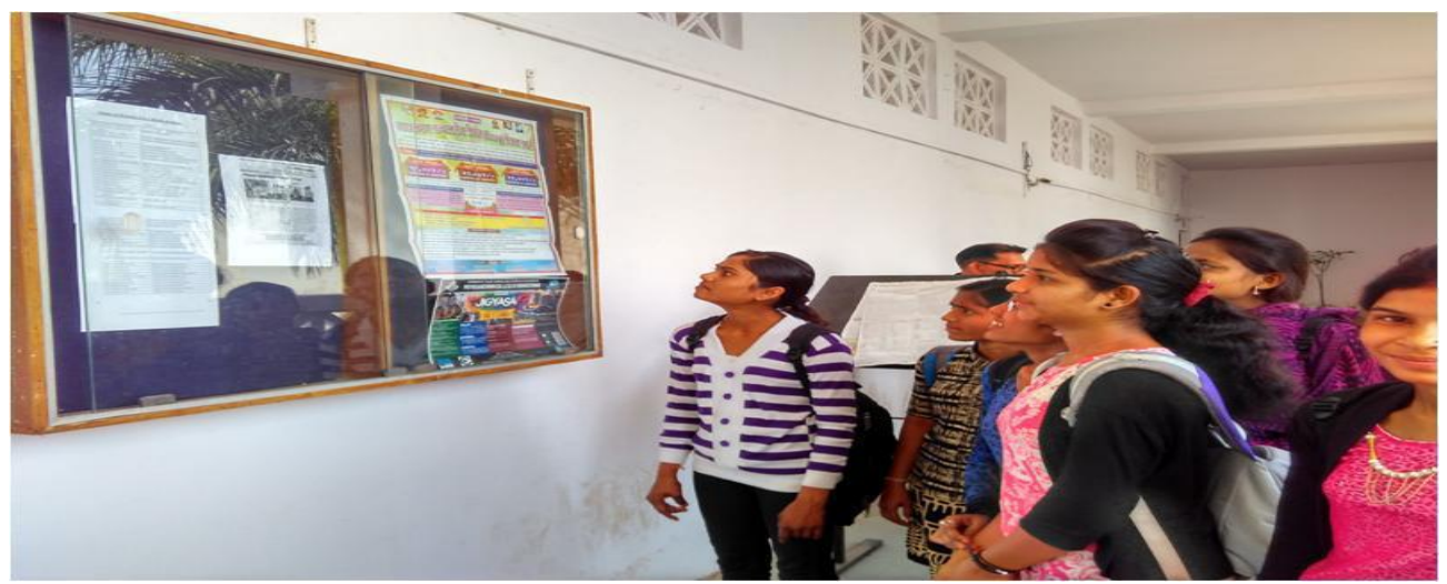
Students are standing before the news corner which is set up by the Library Dept.