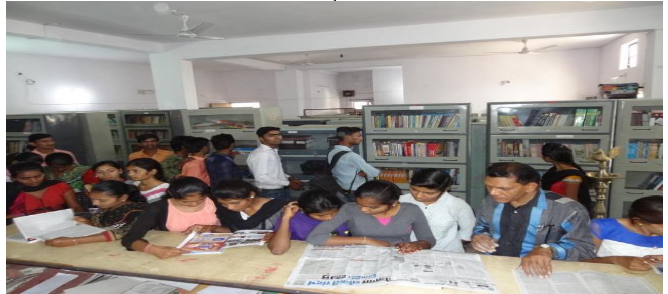
Students are reading and noticing their unique news in the newspaper

News-corner becomes ready to all the students in the college. Not only the students but also all the teachers and even the visitors are attracted by this news corner.