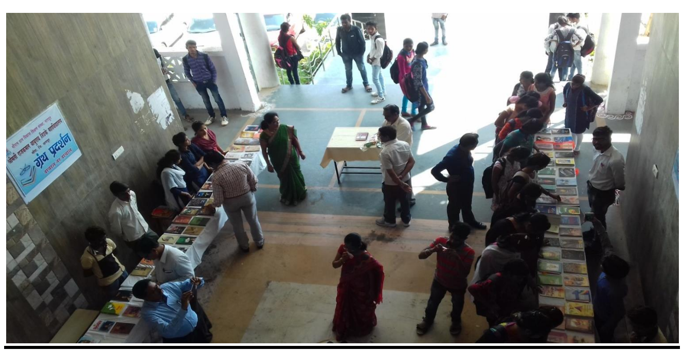
Students are watching and buying books at the book exhibition organized by the college library